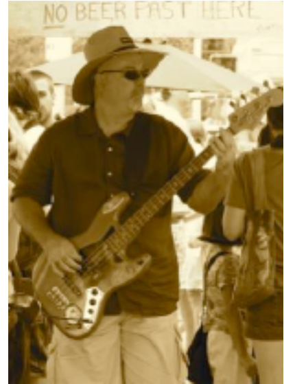
Roaming Bass under the --> NO BEER PAST HERE sign