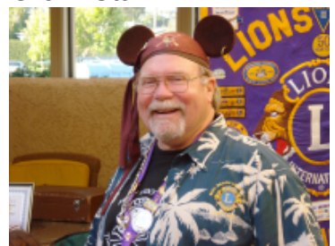
Immediate Past President