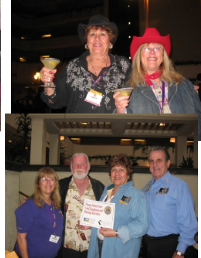
More information & updates at - http://SealBeachLions.com