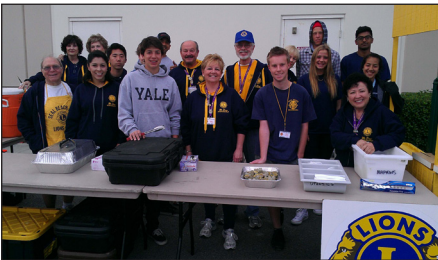
Lions and Leos serving at the Original Parts Group pancake breakfast fundraiser.