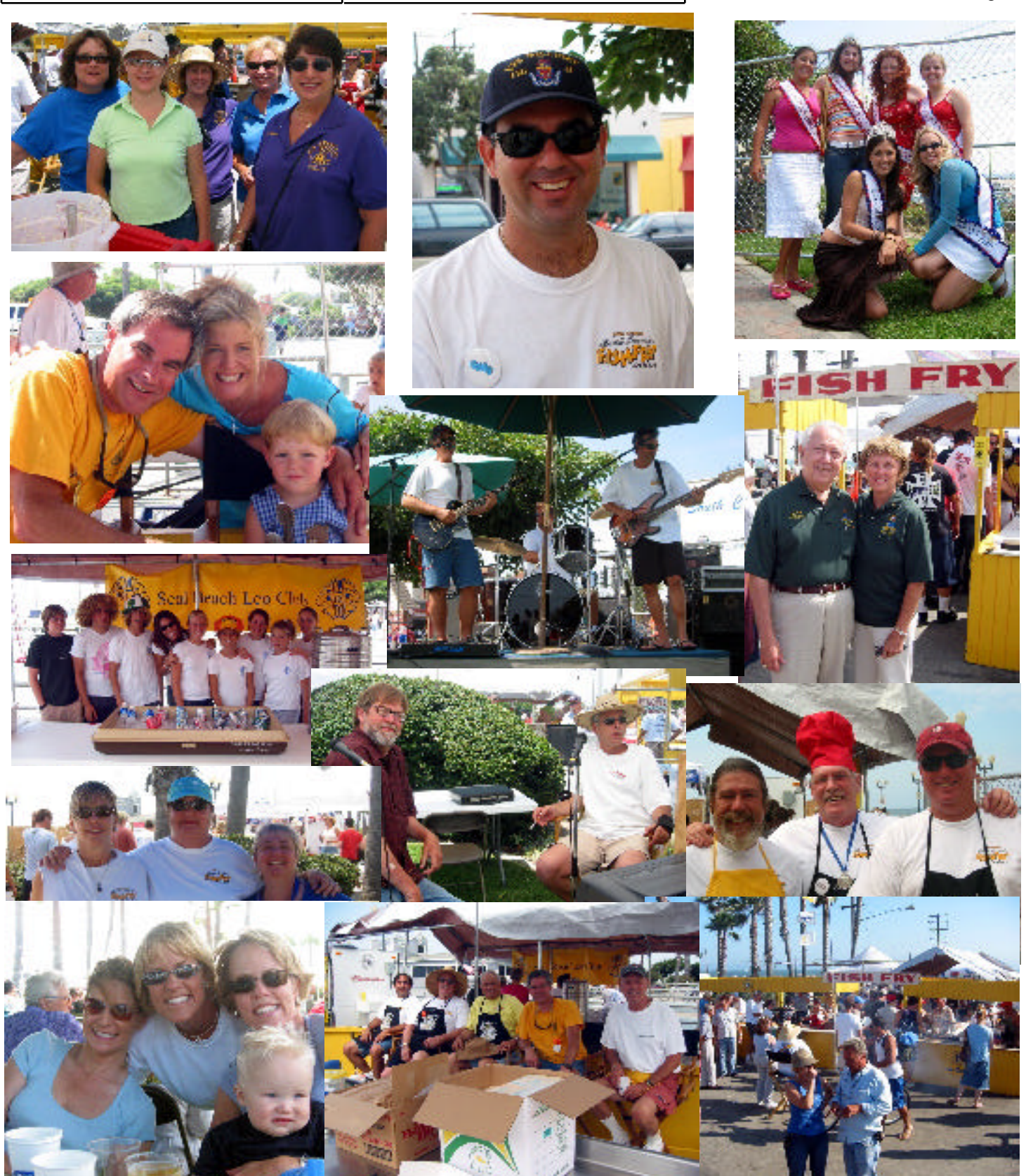
More information & updates at - http://SealBeachLions.com/