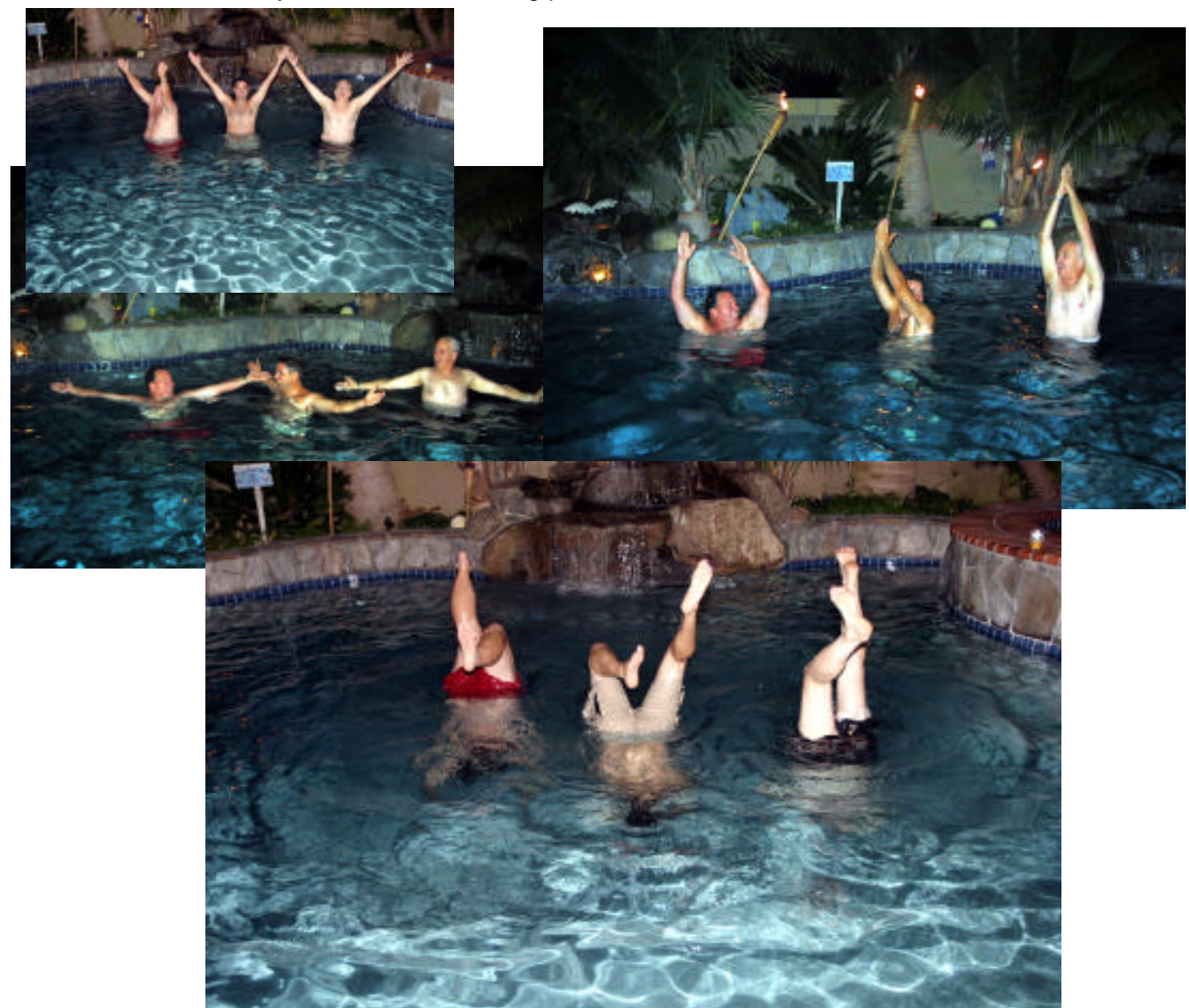
More information & updates at - http://SealBeachLions.com

Like poetry in motion, the gracious and graceful swan team of 'Kahuna' and 'Bruiser' took the budding 'Athenian Duckling' under their wing and mesmerized the gathering with their exciting GOLD MEDAL "trio" synchronized swimming performance.